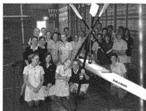
Christening 'Bust a Move'