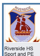
Riverside HS Sport and PE